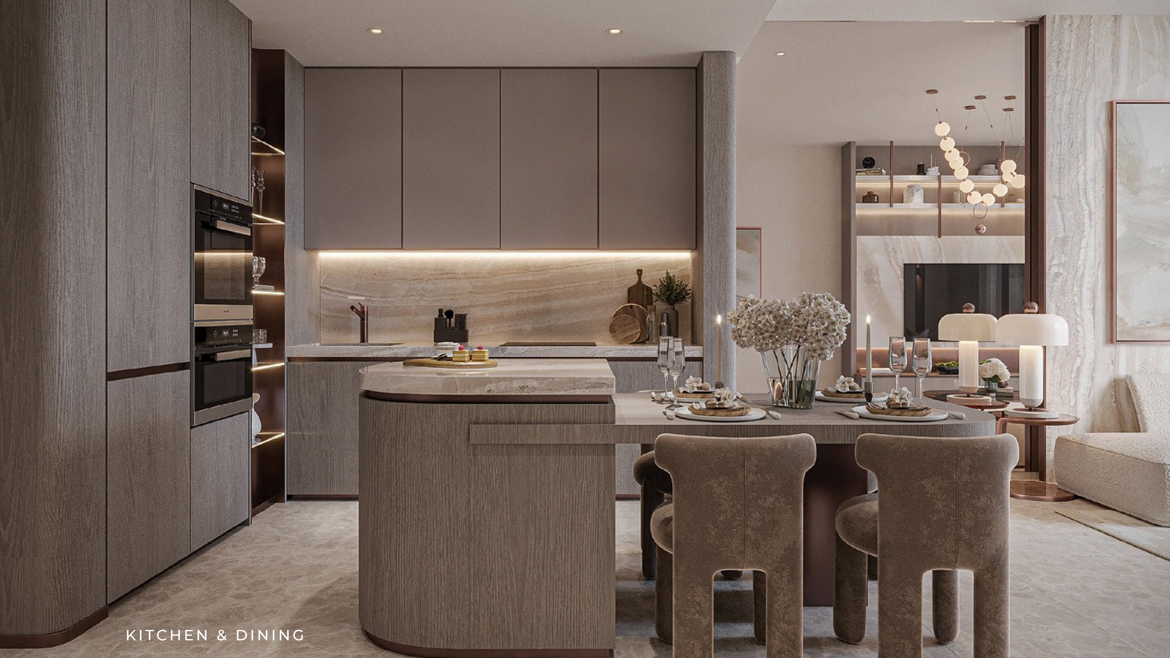
KITCHEN & DINING