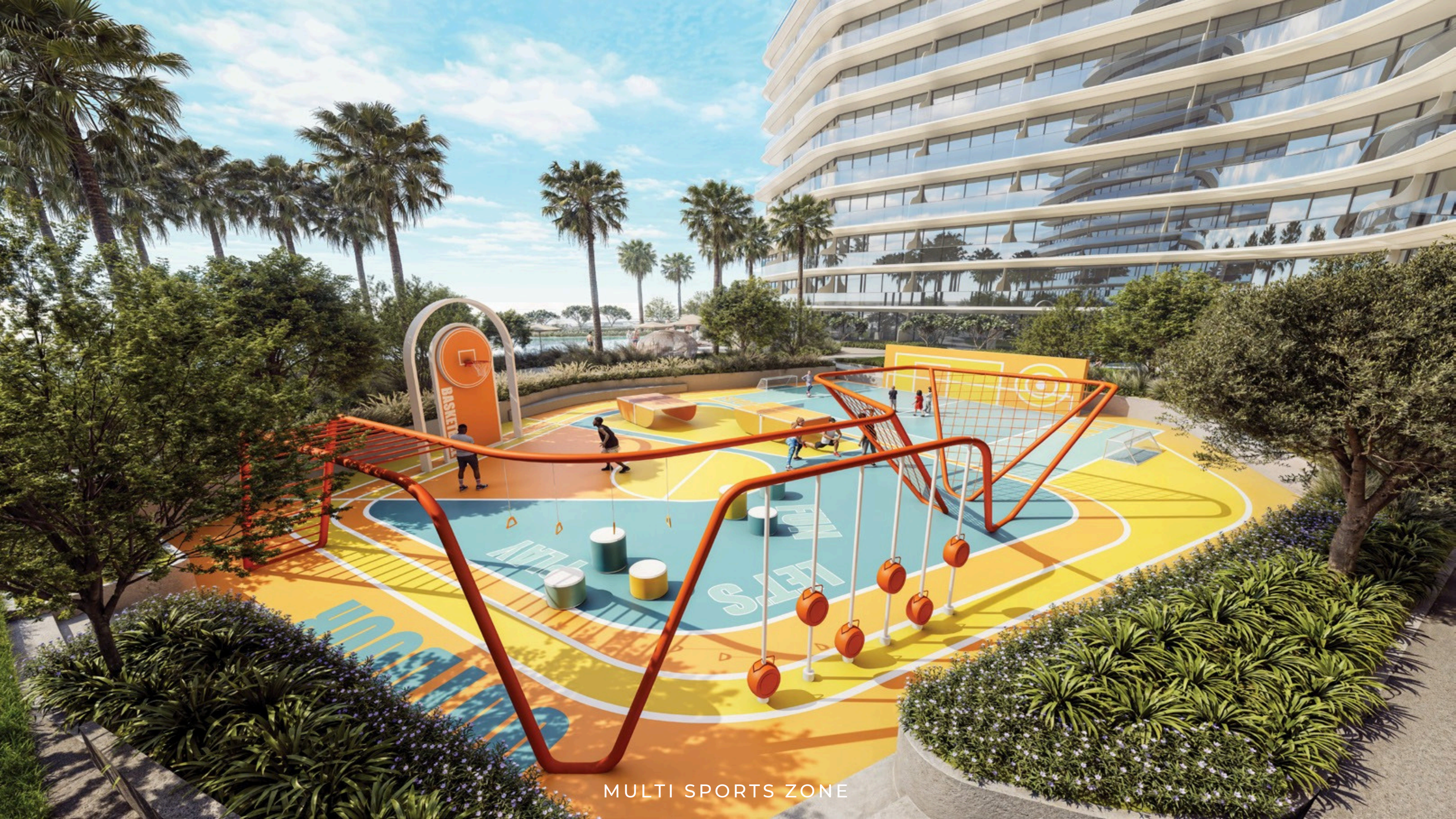
MULTI SPORTS ZONE